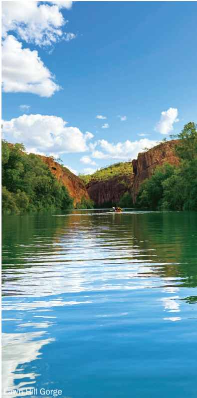
Lawn Hill Gorge