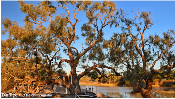
Dig Tree TEO Reichlyn Aguilar