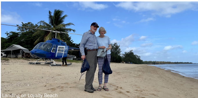
Landing on Loyalty Beach