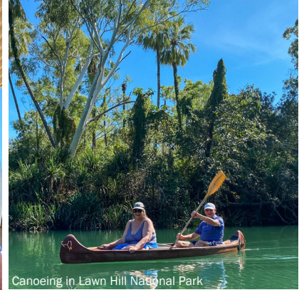
Canoeing in Lawn Hill National Park