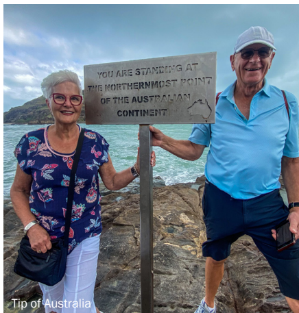
Tip of Australia