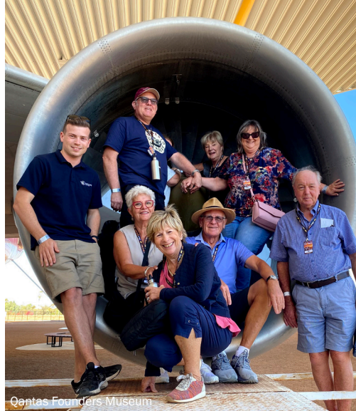
Qantas Founders Museum