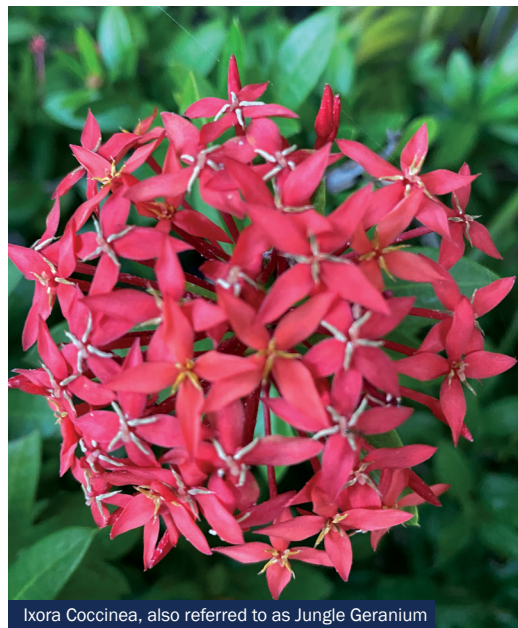
Ixora Coccinea, also referred to as Jungle Geranium