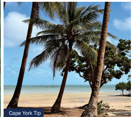
Cape York Tip