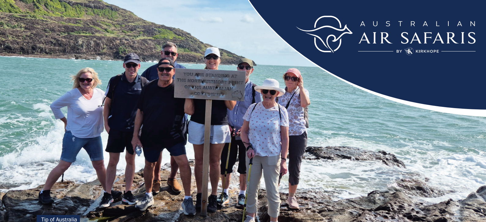
Tip of Australia