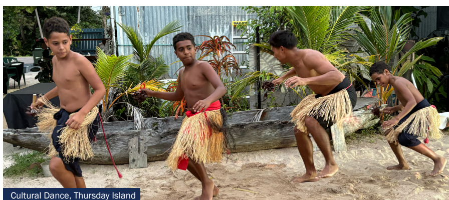
Cultural Dance, Thursday Island