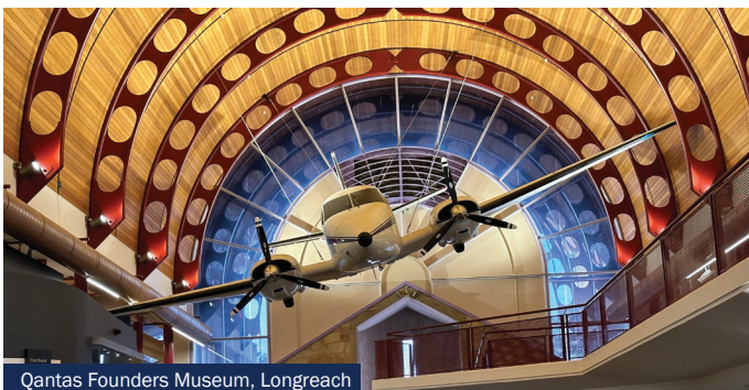
Qantas Founders Museum, Longreach