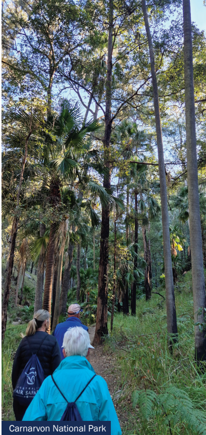
Carnarvon National Park