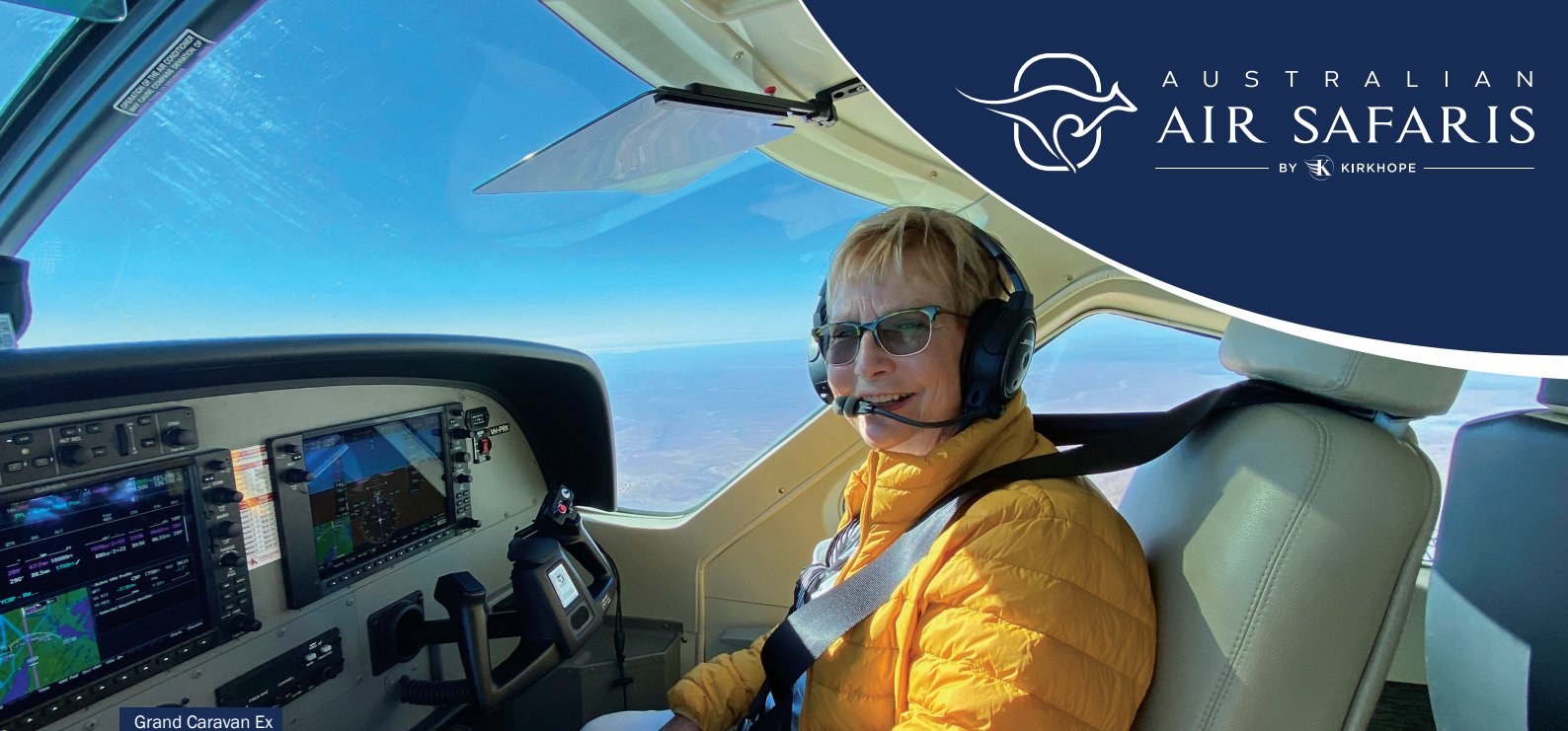
Grand Caravan Ex