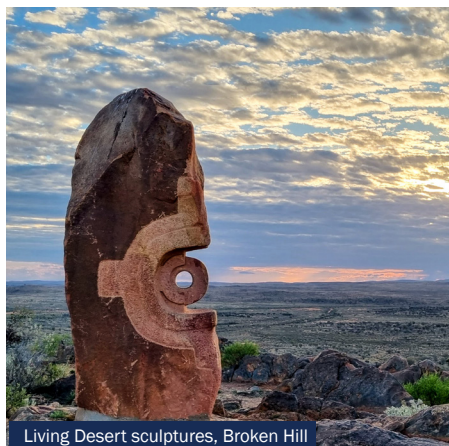
Living Desert sculptures, Broken Hill