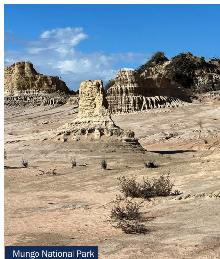
Mungo National Park