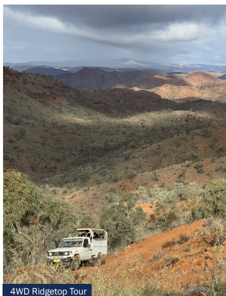
4WD Ridgetop Tour

This three-day air tour is a fabulous introduction to the best of the great Australian Outback. Innamincka, Birdsville, Lake Eyre and Flinders Ranges elicit strong images of remoteness, dramatic landscapes, explorers, red dirt and quintessential Australia. From historic sites and desert dunes to vast salt lakes and remote wilderness, this is the perfect entrée into the outback's raw grandeur—told through its landscapes, stories, and resilient characters.