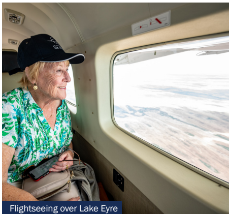
Flightseeing over Lake Eyre

In the afternoon, it's time to head home. Fly over Lake Frome en route, arriving in the early evening.