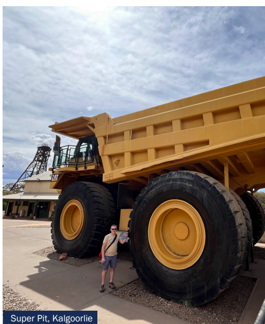
Super Pit, Kalgoorlie