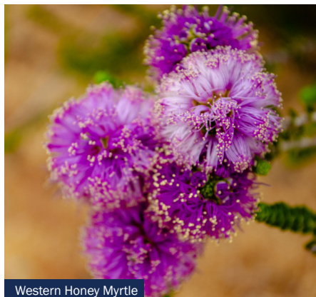
Western Honey Myrtle