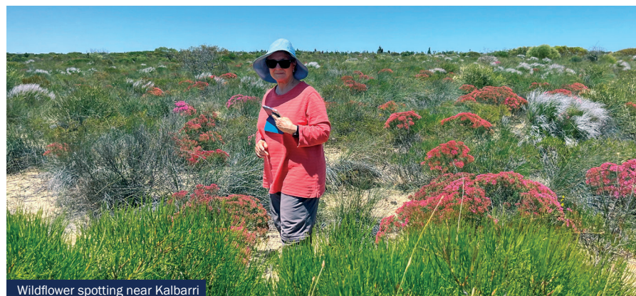
Wildflower spotting near Kalbarri