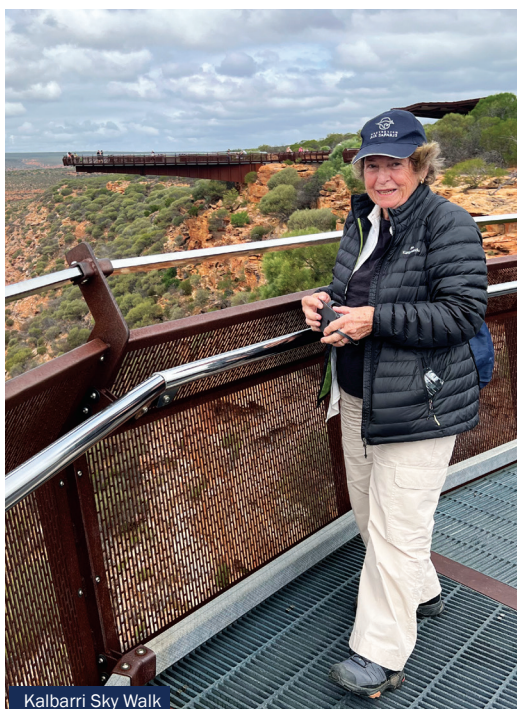
Kalbarri Sky Walk